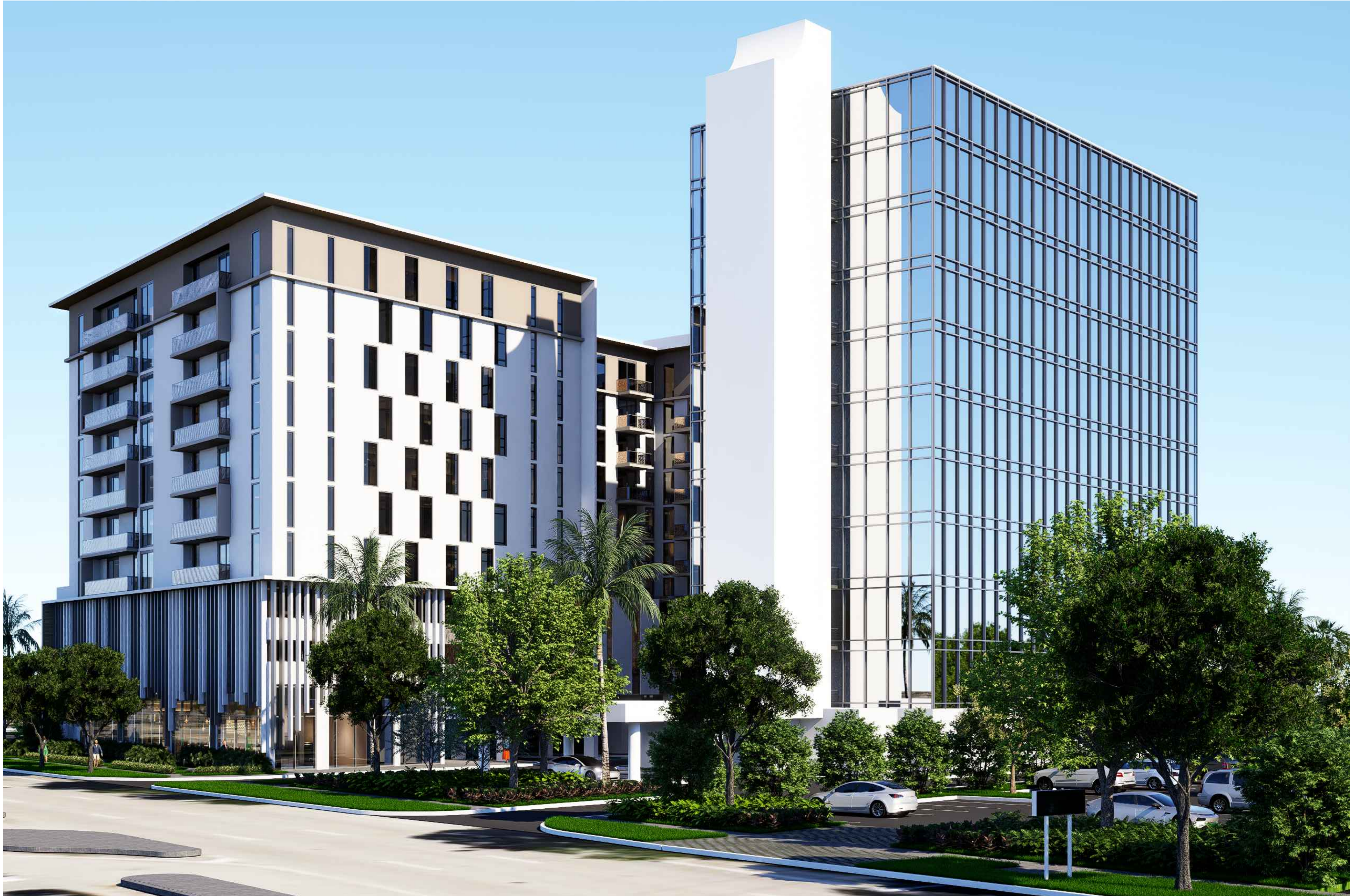
FIRE TRUCK ENTRANCE ON FEDERAL HIGHWAY